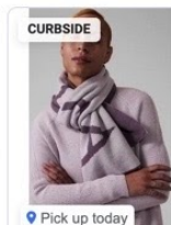
Athleta Women's Daily Knit Scarf Dark Sky Viole...