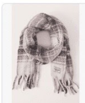
girls super soft scarf in cream plaid | size one...