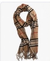
Classic Cashmere Feel Winter Scarf...