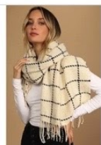
Beige and Black Plaid Knit Scarf | Womens | One...

Scarves are so warm and stylish!!!! WHAT ELSE CAN BE SO STYLISH AND WARM LIKE A SCARF!!!! I personally love scarves because they are gender neutral and super warm and cozy and keep your neck warm. If you have short hair and nothing to cover your neck then get these scarves!! I personally have scarves even with my hair over it to keep my neck nice and toasty!!!